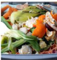
Fruit & Vegetable

Biodegradation without installation, environmental and energy saving.