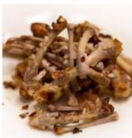
Fish & Chicken Bone