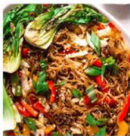
Noodle & Rice